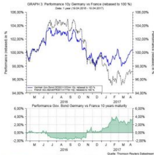
Chart: German vs French government bonds with remaining time to maturity of 10Y Observation period of 1Y (red marks of graph 1): performance Source: Datastream, as of 18 April 2017