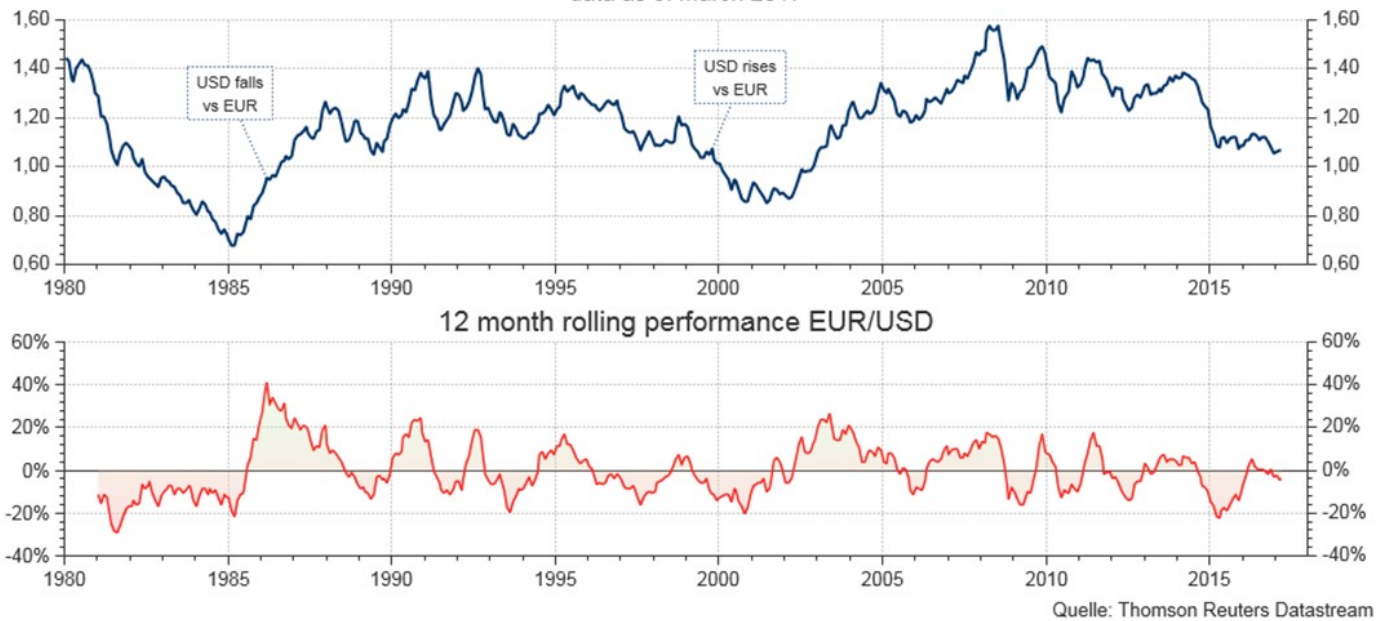
Chart: Development EUR/USD long-term. Prior to the launch of the euro in ECU.