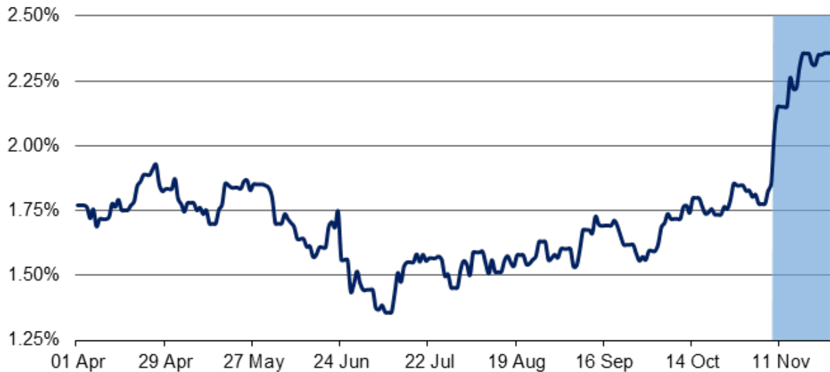
Fig.2: US 10Y government yields