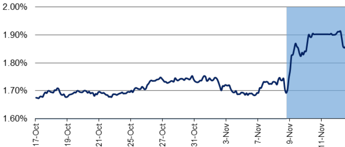
Fig. 2: US - TIPS-implied Inflation expectations

Note: TIPS = Treasury Inflation-protected Securities