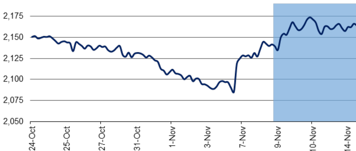
Fig. 4: S&P 500