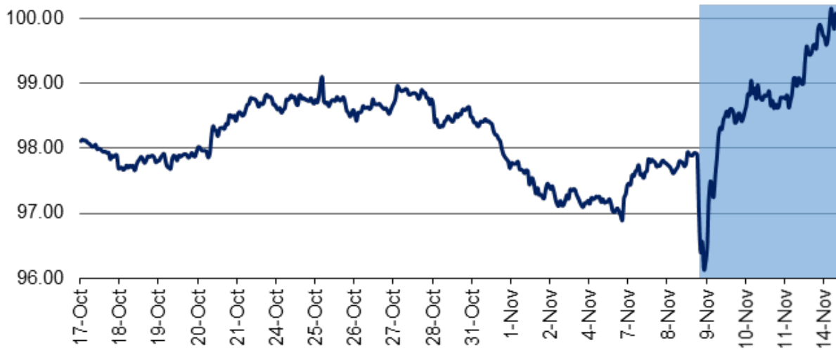
Fig. 3: US Dollar spot index