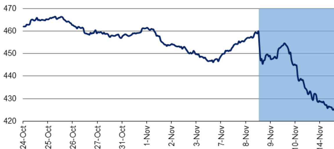
Fig. 5: FTSE EM Equities